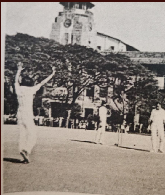
Students playing cricket in Gymkhana grounds