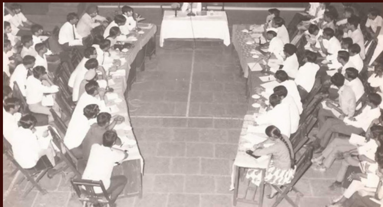
Some of the first students in Podar College