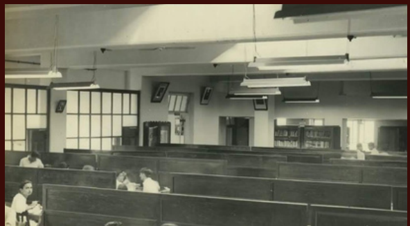
Early days of the Podar library