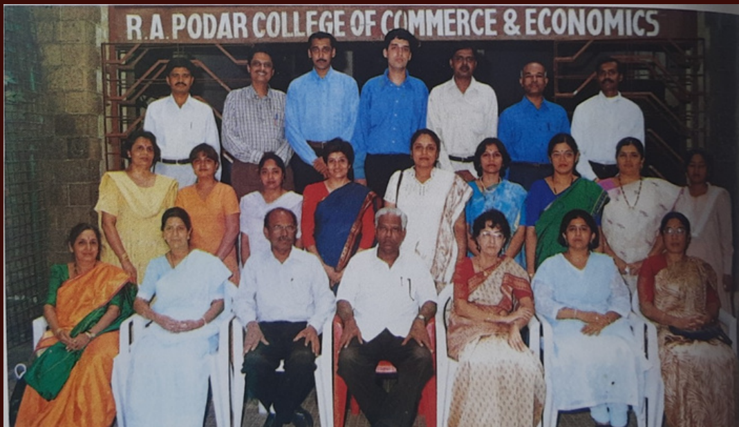
Junior College Teaching Staff