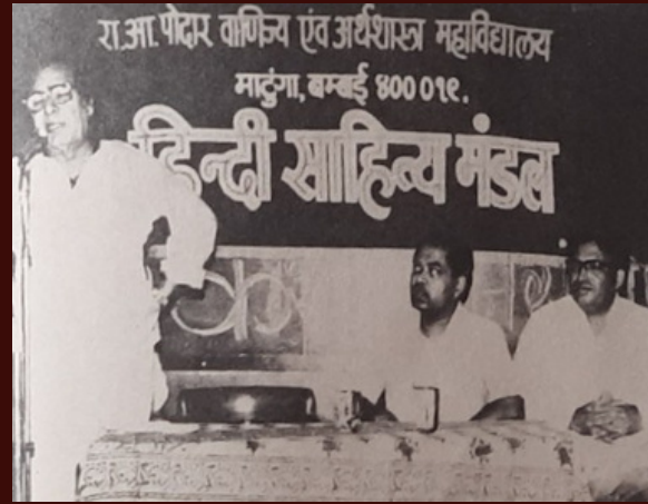
Inauguration of Hindi Sahitya Mandal