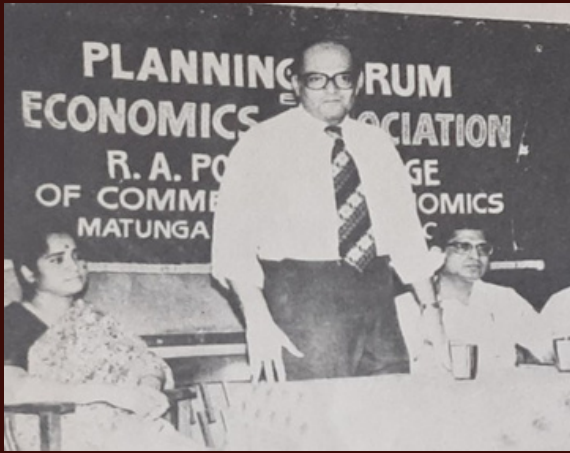
Inauguration of Planning Forum