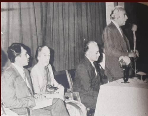
The Chief Guest delivering his address at the Annual Day