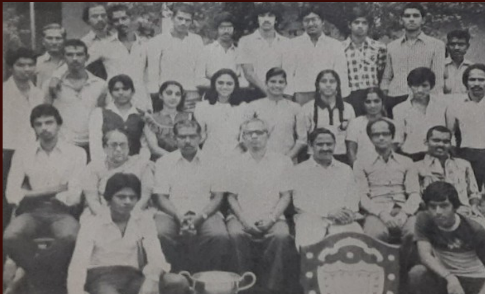
Madras IIT Basketball Tournament Team