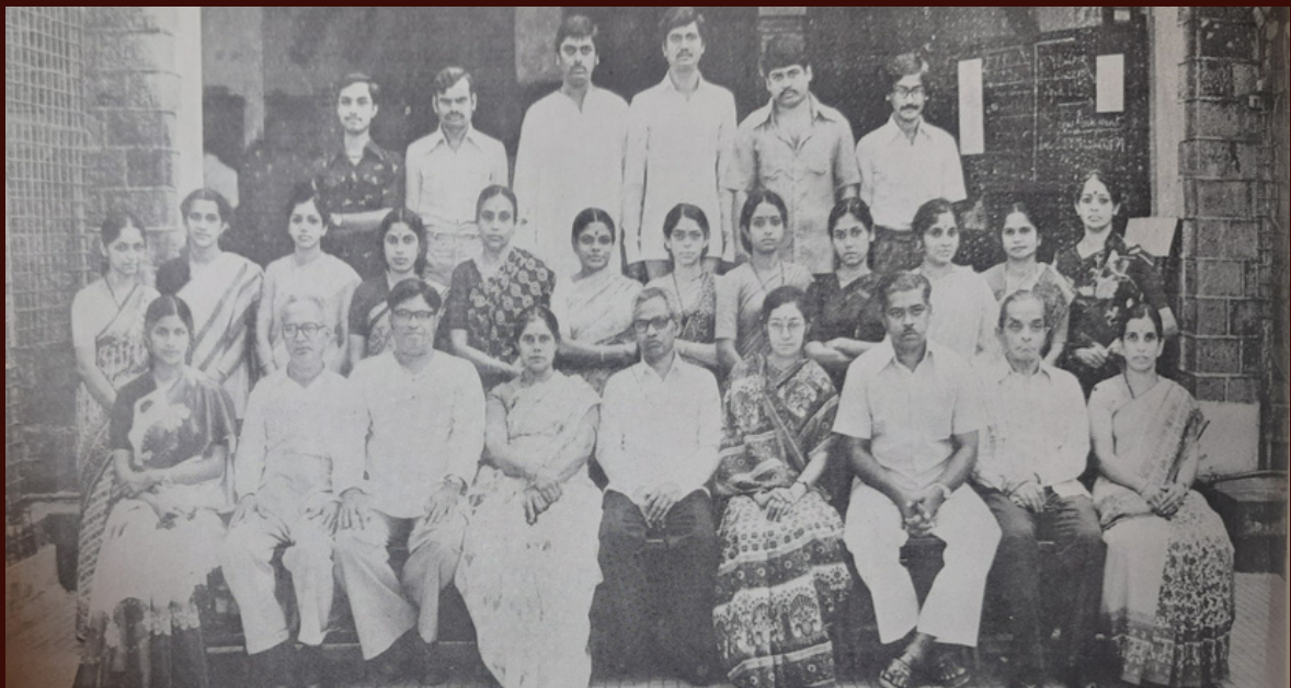
Junior College Teaching Staff