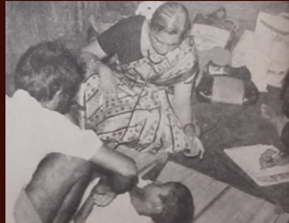
N.S.S. Medical Camp, Barhanpur