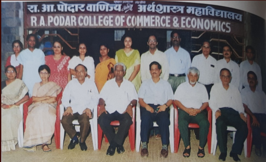
Degree College Teaching Staff