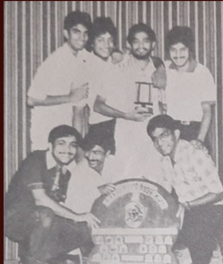
'Bhoma' team with the Shakespeare trophy for English Drama