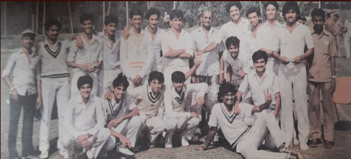
The winning cricket team