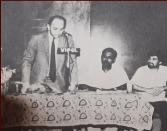
N.S.S. Annual Day