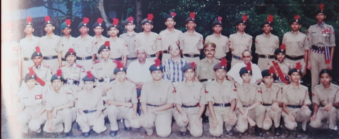
N.C.C. Cadets 2001-02