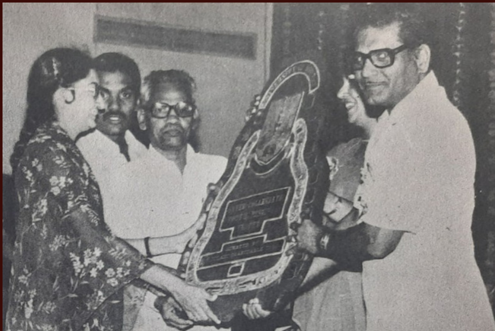
Youth Festival trophy received by Principal