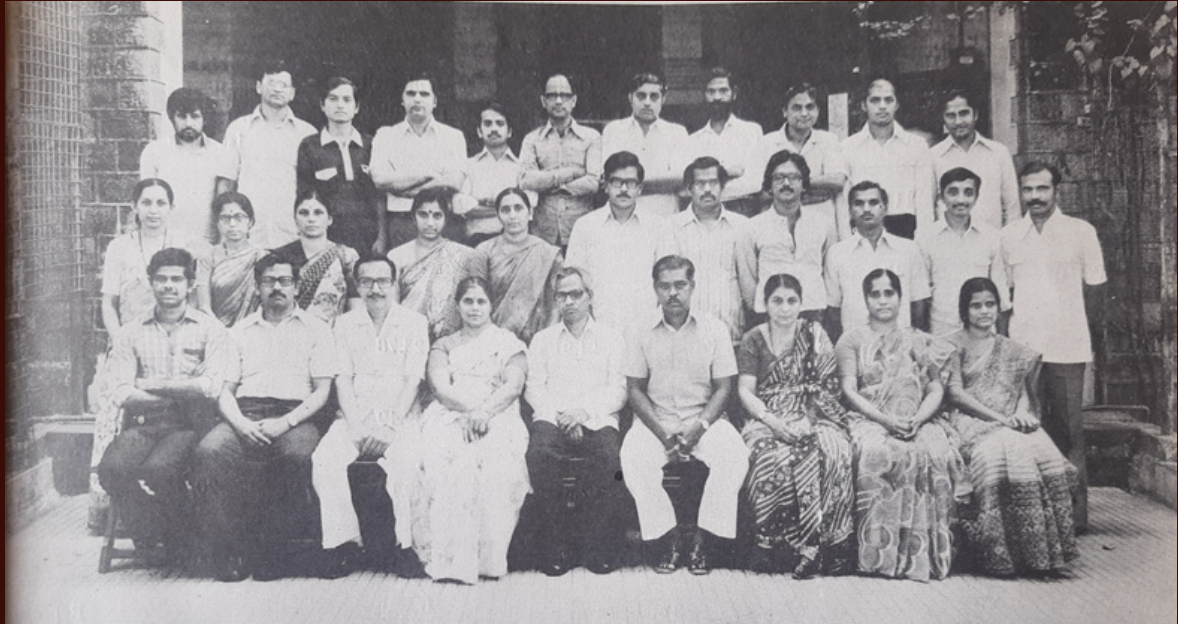
Senior College Teaching Staff