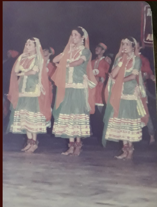
Youth Festival Dance Team