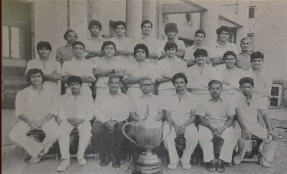
Inter-Collegiate Cricket Champions