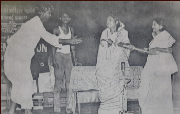
Hindi Drama at Youth Festival