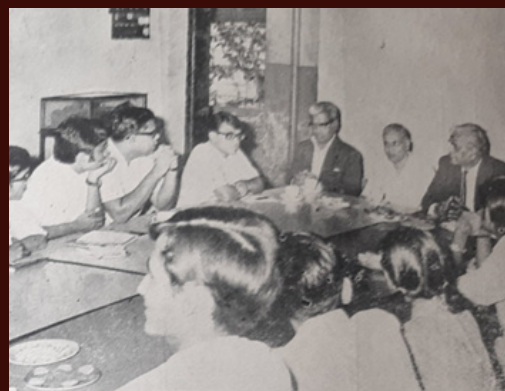
The Vice Chancellor meets the students' representatives